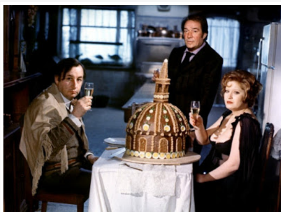
La Grande Bouffe

For one thing, I am shy and I don't like to be in front of the camera. Even when I was 6-years-old at birthday parties, I didn't want to be in pictures. I would always be behind the camera. So I knew from the beginning that if I ended up working in cinema, I would not be in front of the camera. I never had the desire to be an actress. All my brothers became actors perhaps because they wanted to emulate our father. It's natural for a boy to want to be like his father. I began working in cinema after the death of my father.