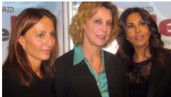
Maria Sole Tognazzi, Margherita Buy and Sabrina Ferilli at the Rome premiere of Io e lei

relationship, second. When the film was released in Italy last year, the two actresses made the rounds all over Italian television answering questions relating to gay and lesbian relationships. But when I saw the film, that element was clearly secondary to the love and affection the two feel for each other. In an interview with Italian media, Ferilli described the film as "a story about sentimentality rather than homosexuality."